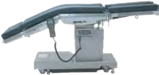
BACK PIECE DOWN 30°