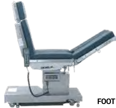
FOOT PIECE UP 30°