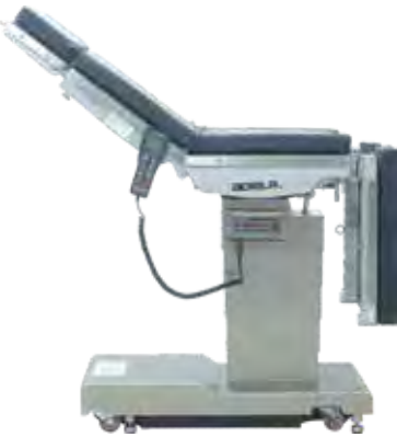
FOOT PIECE DOWN 90°