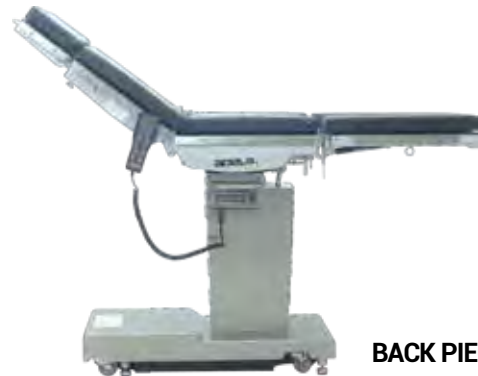
BACK PIECE UP 75°